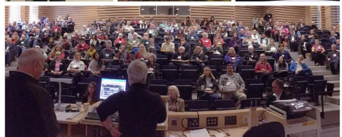
Fall ParksFest 2017 held at Simon Fraser University. It was an extra special year celebrating 50 years of the Regional Parks system.