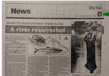
The Sun , December 13, 1984.